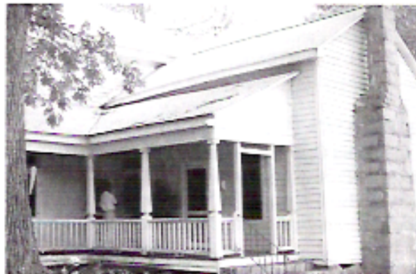
Banks cousins visit on back porch of Coldwater Plantation House.