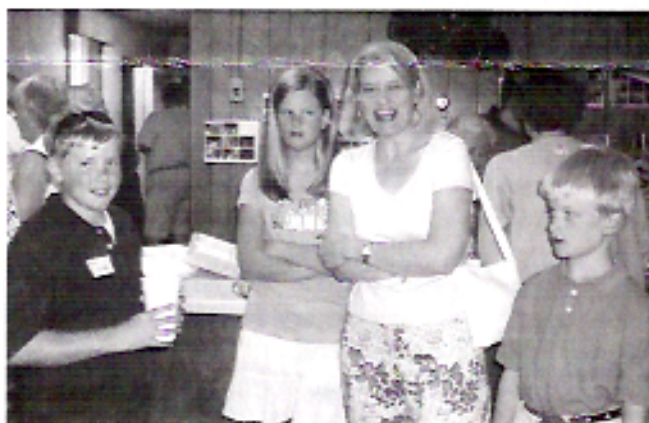
We were pleased to have members of the younger generation to attend the reunion.